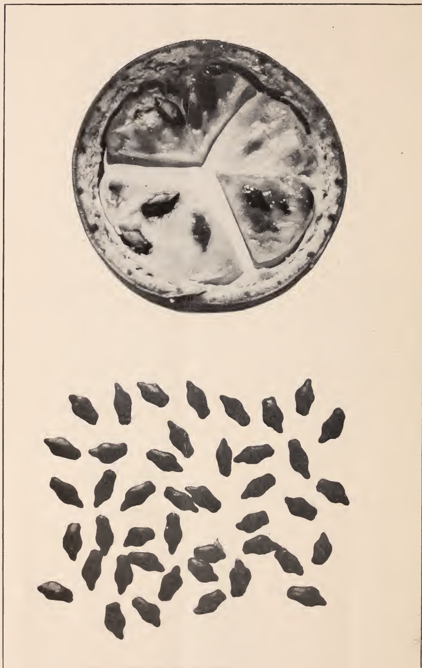
CALYCOPHYLLUM BREVIPES PITTIER.